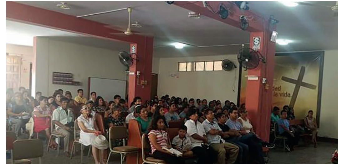
First Baptist Church, Piura

Now that I find myself in the city of Piura, a couple hundred miles west of Iquitos, up and over the Andes and stopping just short of the Pacific, what am I looking forward to here?